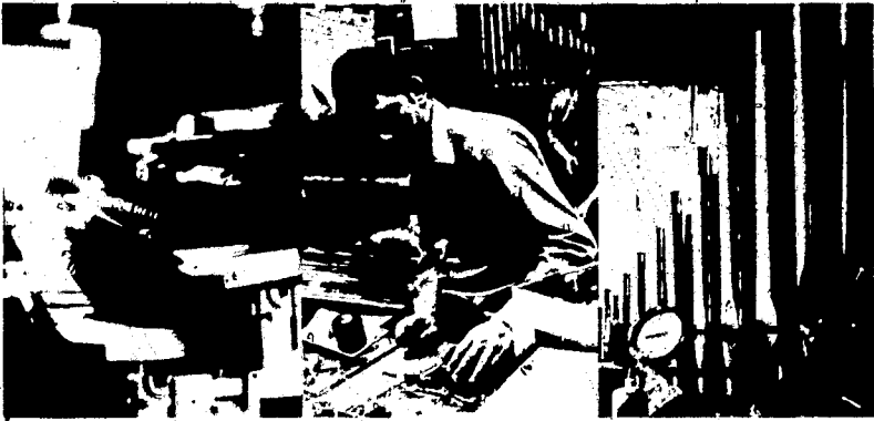
FIG. 2. Part of the "Music Monster" for the Synthesis Lab

Our initial forays into the music field have been in terms of real organ pipes to be run under program control (shown in figure 2). Next we'll look at a modularly designed synthesizer. This later technology is replete with applications of the concepts of function, algebraic products and sums, periodicity, summation of series, local linearity, transforms, etc.