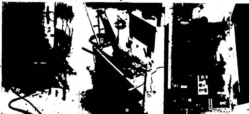
FIG. 3. "Rube Goldberg" Machines Designed and Built in Modeling Lab

precisely what kind of mathematics curriculum might evolve from our work. However it is clear that content-wise, the curriculum will be a very rich one. The more we work with the labs, the clearer it becomes that the inclusion of mathematical content is not a serious problem, despite any indication to the contrary our hardware orientation might suggest.